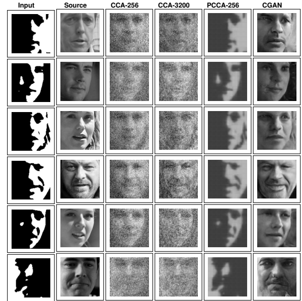
Fig. 4. Sample Mooney-to-Photo prediction results.

Related Works. Mooney-to-photo prediction is an interesting and challenging research topic in computer vision,