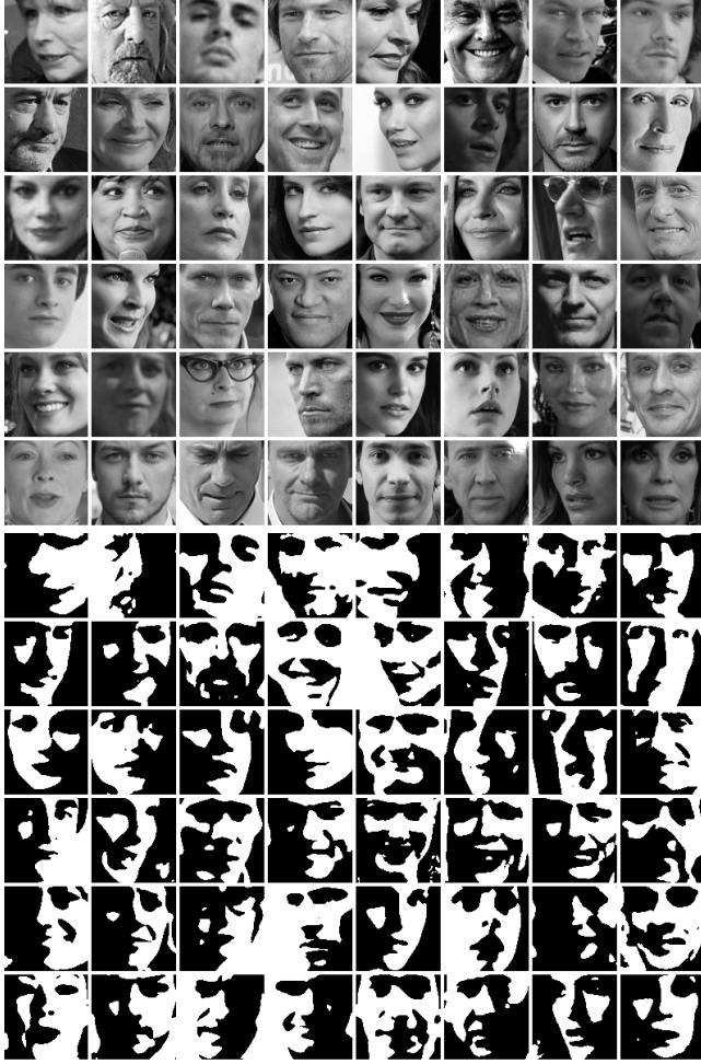
Fig. 3. Sample results from our Mooney face generator.

Large-scale Mooney face dataset. We generate 35 candidates for each source face photo from the 35 combinations of k and t . Our Mooney face classifier is used to pick out the most Mooney-like candidate. If that candidate has a low score, we reject the face photo. We build our large-scale Mooney face dataset based on Facescrub images. With a high Mooney score threshold to ensure the quality of such automatically generated Mooney faces without human judgement verification, we obtain a Mooney face dataset with 13,460 images of 523 identities, sample results shown in Fig 3.