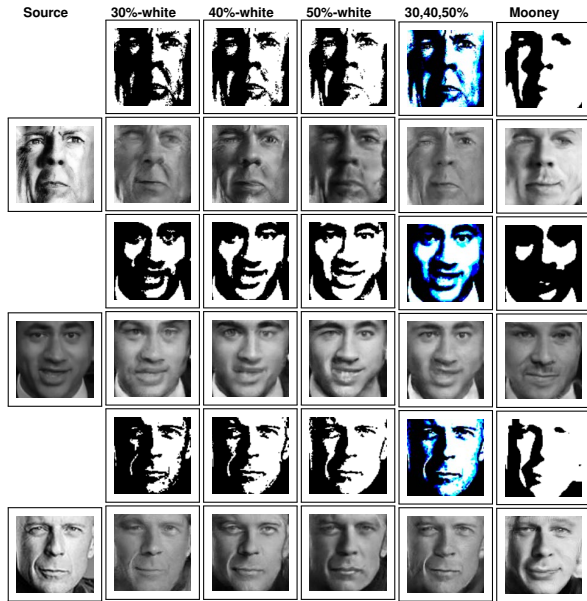
Fig. 5. Sample prediction results from two-tone inputs.