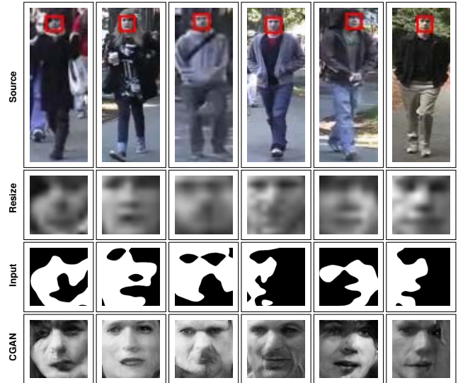
Fig. 6. Sample prediction results from surveillance photos.

Cross-Tone Prediction Results. Fig.4 shows grayscale face predictions and Table3 prediction errors. Our CGAN